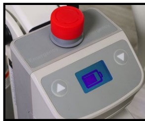
LCD battery level display; audible low-battery indicator