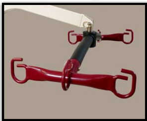
6-point spreader bar maximizes sling options