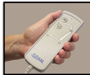
2-button pendant with LED indicator