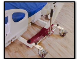
Underbed clearance, allows use with most low beds